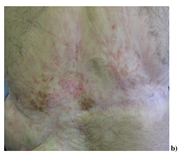
Fig. 4-a) and b): during the follow-up, 3 years later, area of persistent erythema and desquamation was observed on the lumbar region.