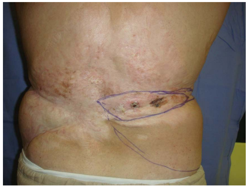
Fig. 1 – Two painless black lesions in the middle of the burn scar, developing 46 years after the burn.

Histopathological diagnosis of one lesion was ulcerated superficial spreading melanoma (SSM) in the scar tissue (Breslow 0.85 mm, Clark III, pT1b), whereas the other lesion was diagnosed as lentiginous melanocytic hyperplasia (LMH). Final pathological findings confirmed negative excision margins, which extended 1 cm into the surrounding tissue, in accordance with the European guidelines (Figures 3 a–d).